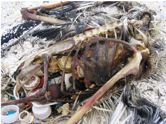
An Albatross Chick Carcass